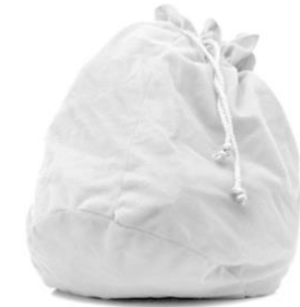
White Linen Bag