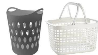
Portable linen baskets (where lift may not be available)