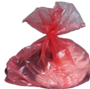
Red algininate dissolvable strip bag or fully dissolvable bag