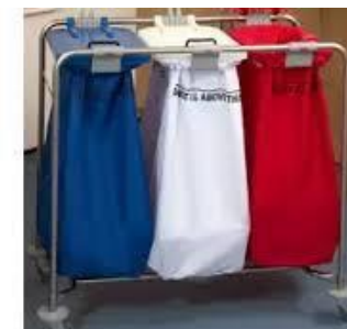
Triple, coloured, lidded linen trolley