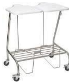
Foot pedal operated, lidded, double linen trolley