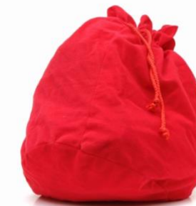
Red Linen Bag