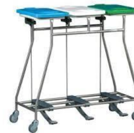
Foot pedal operated, coloured, lidded, triple linen trolley