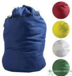
Coloured launderable linen bags for use with trollies