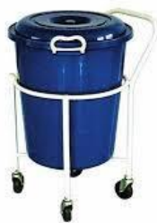
Removable lidded linen bin on wheels