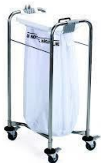
Single wheeled, lidded trolley