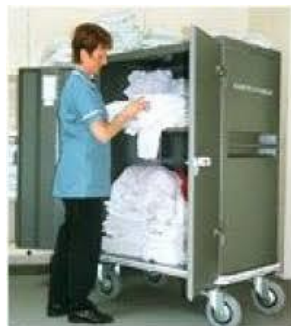
Alternative trolley for storage of clean linen