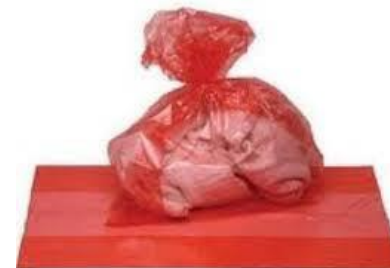
Red alginate water-soluble laundry bag