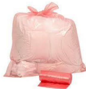
Red water-soluble strip sack for infectious linen